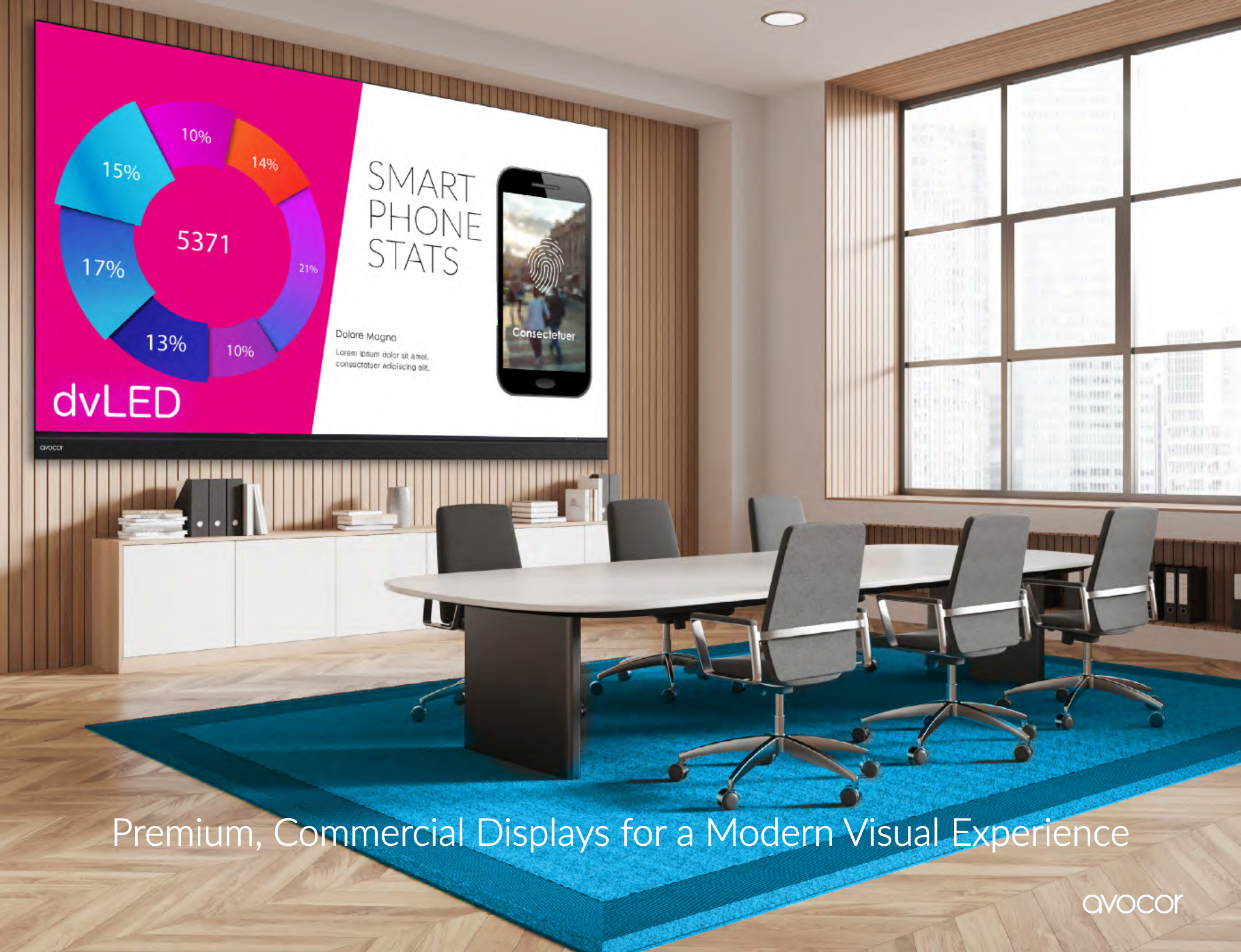
Premium, Commercial Displays for a Modern Visual Experience